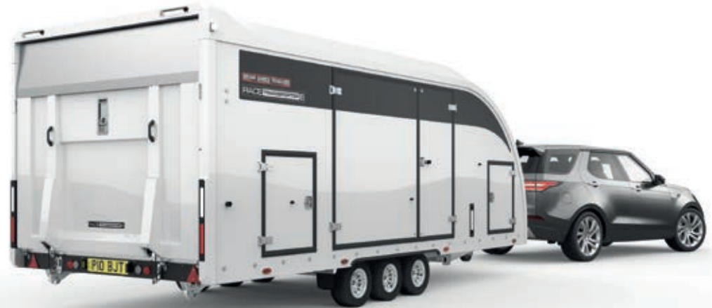
Race Transporter 6 with standard white body and black vinyl graphics package