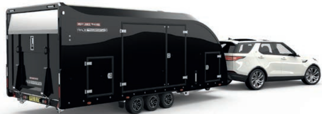
Race Transporter 6 with optional black body and optional Anthracite diamond cut alloy wheels